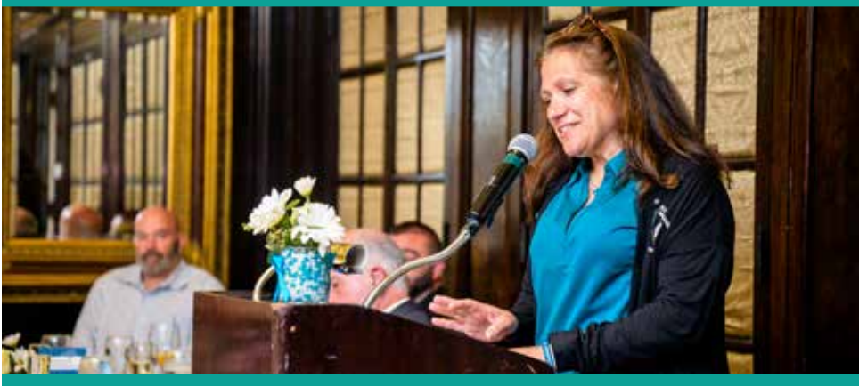
Photography by Dantone Creative